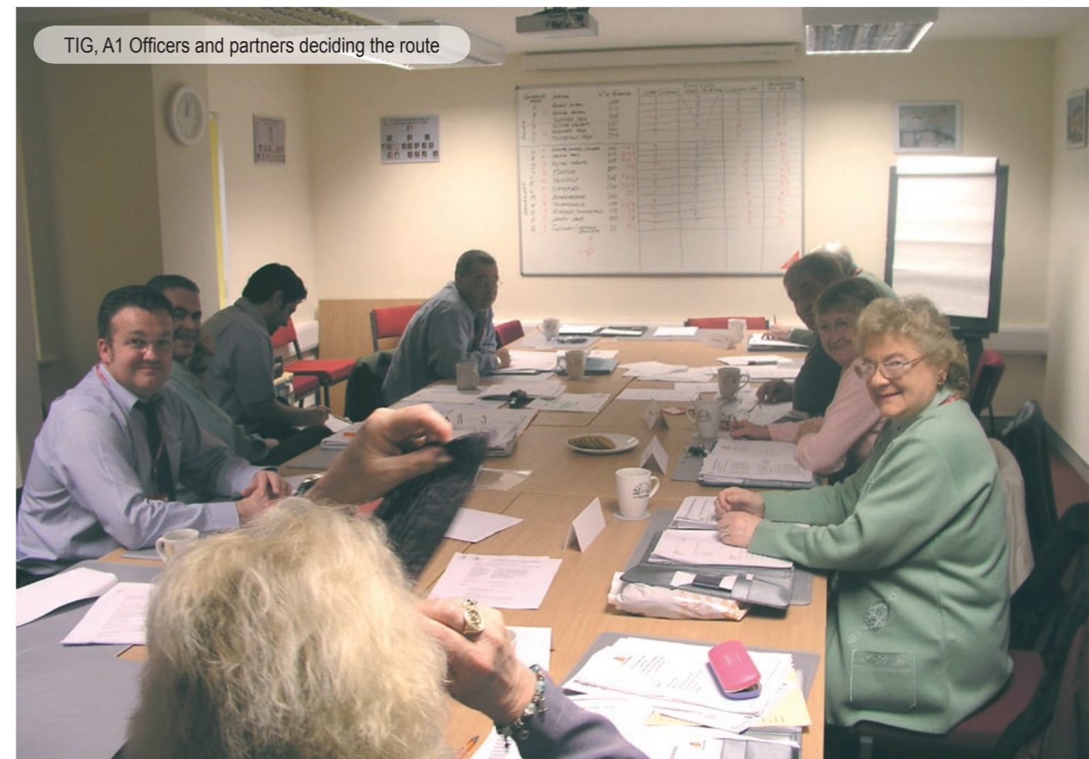
TIG, A1 Officers and partners deciding the route

The members of the meeting took various factors into consideration and looked at routes that would prioritise the oldest properties first or routes that would prioritise senior citizen dwellings first and whilst these types of routes have many positive arguments they would be very costly due to the number of times the partners would have to re-locate and more money spent on moving around the district would mean less money for improvements.